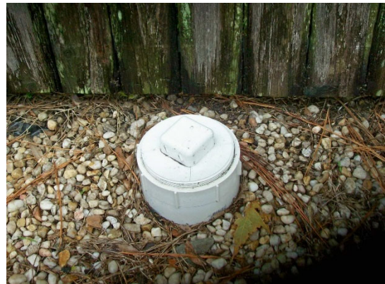
Undamaged Cleanout Cap & Assembly