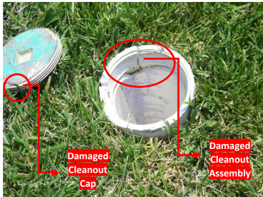
Damaged Cleanout Cap & Assembly